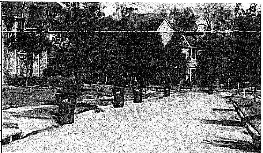
TYPICAL CART PLACEMENT